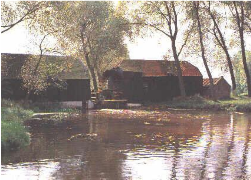
View from the north, before installation of the second waterwheel.