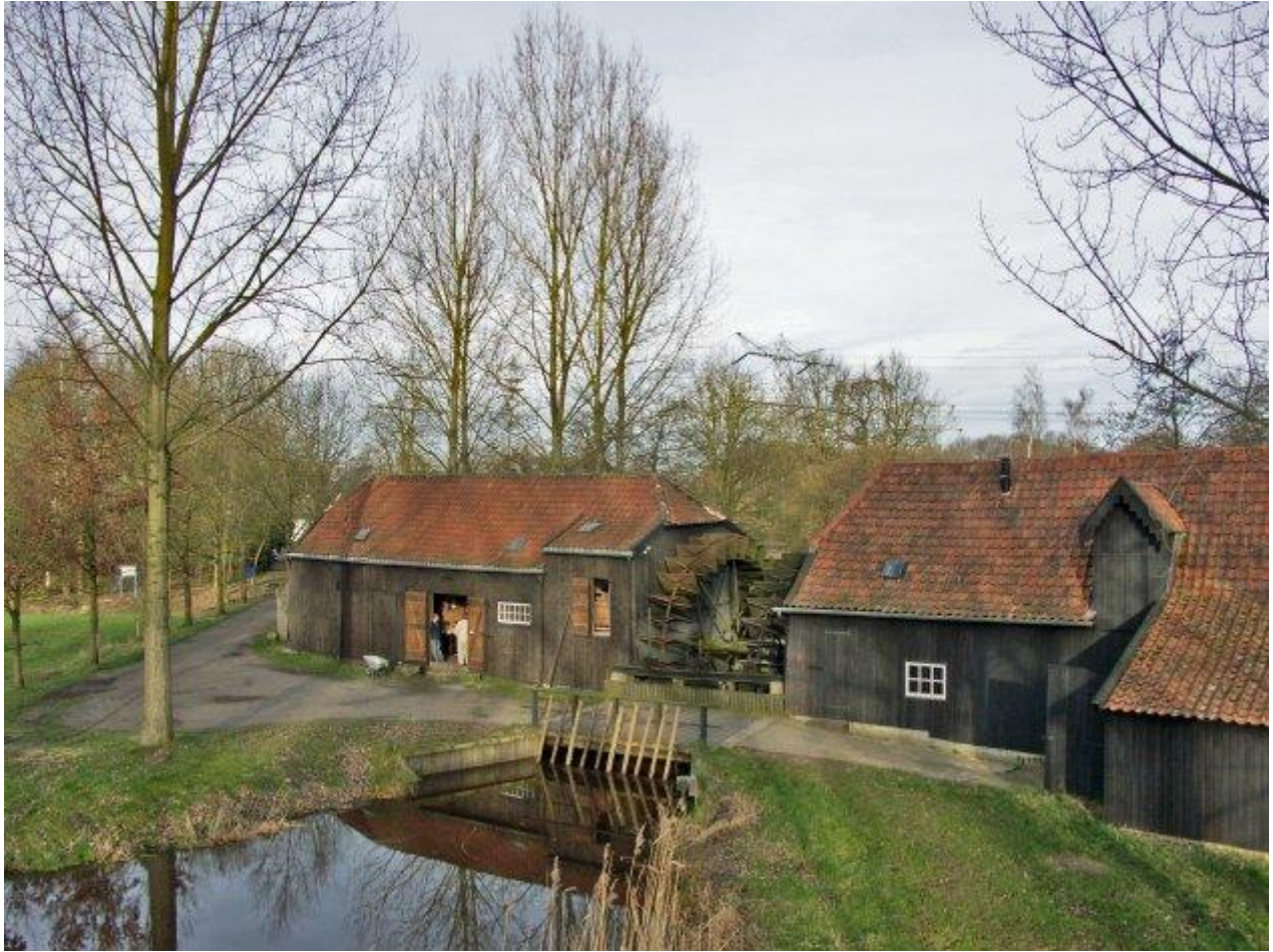
The Collse Watermolen, with two wheels and the original red roof. © Photo: Norbert van Eekeren, Nuenen, feb. 2007 View from the south.