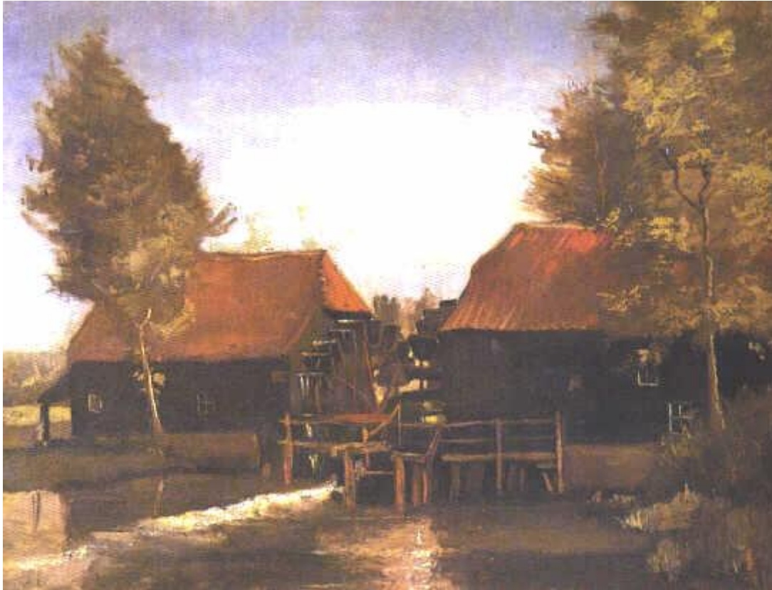
Painting of the mill by Van Gogh, 1884. ©

The watermill was painted by Vincent van Gogh in 1884.